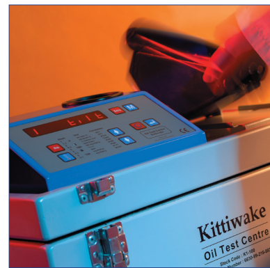
NATO Approved Marine OTC

Parker Kittiwake supply two styles of On-site Oil Analysis Suite. Oil Test centres come in metal or industrial roller cases for portability, while Fuel and Lube test cabinets are designed for wall mounting on-site. Of rugged design and suitable for long term use in harsh environments, the equipment is simple to use and ideal for operation by non-technical personnel.