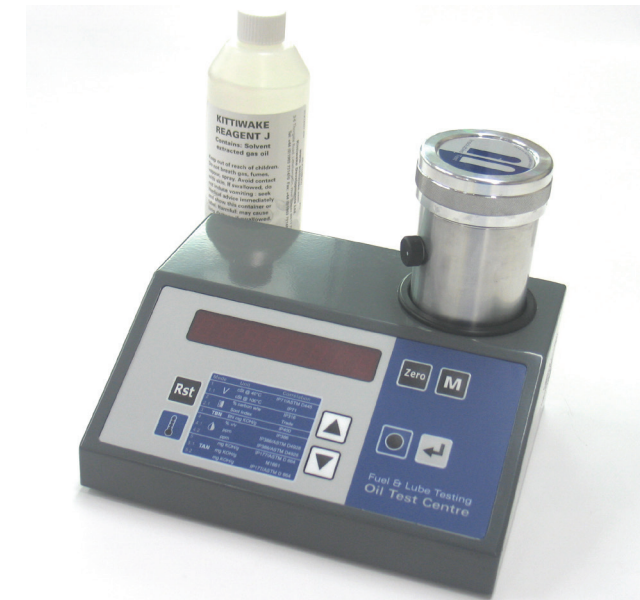
Insolubles Test Cells